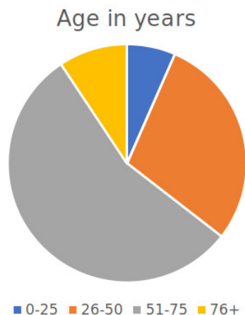
Figure 1. Patient Age distribution